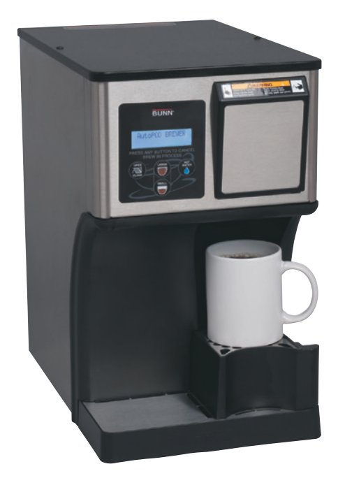
My Cafe AP Dimensions: 15.8" H x 9.7" W x 15.2" D (40.1cm H x 24.6cm W x 38.6cm D)