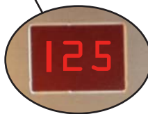
Bean Usage Counter

Digitally controlled Single Bean Grind'n Brew™ Brewer System. Brewer will maintain brew temperature to \pm 1^\circ\text{F} throughout brew cycle. Brew temperature, brew volume (full and half batch), grind portions (full and half batch), operator defined pre-infusion/pulse brewing, energy savings and Low Temp/No Brew are programmable from the front display.