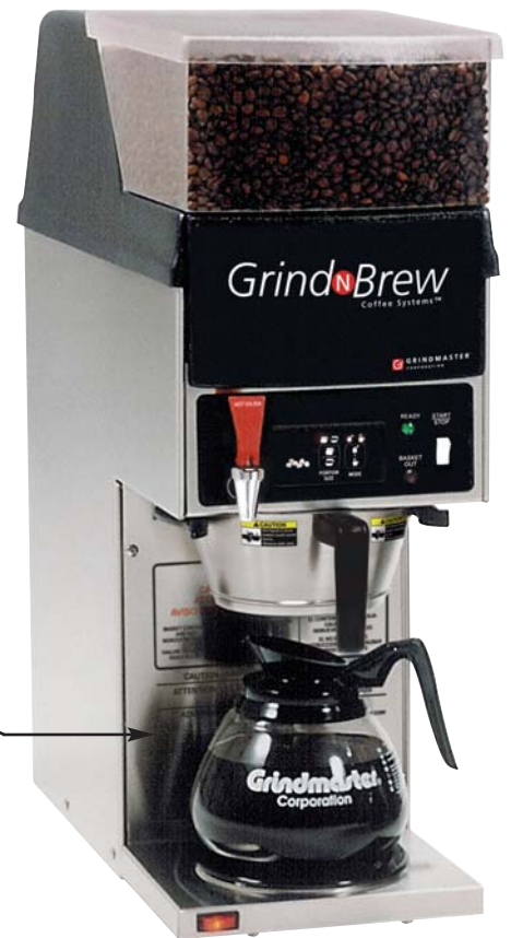
Model 11H (Decanter sold separately)