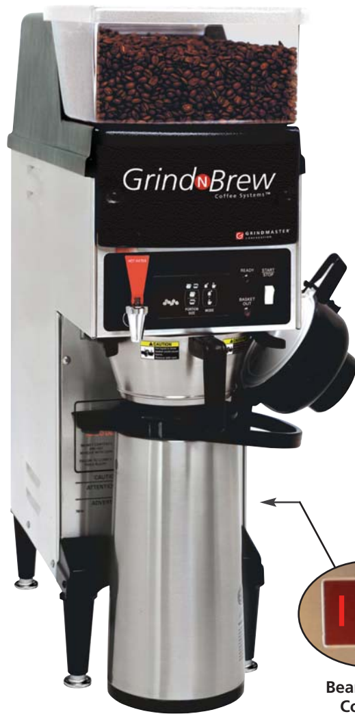
Model 10H (Airpot sold separately)