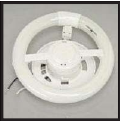
62937 Circle Light Bulb and Fixture