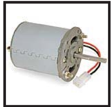
61116-01 Whipper Motor