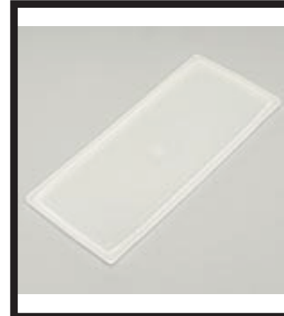
61315 Hopper Lid