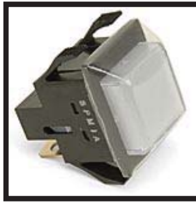
63195 Sealed Dispense Switch