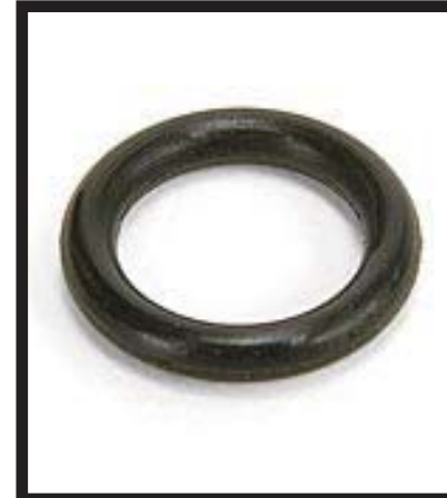
61365 Dump Valve O-Ring