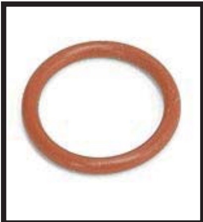
61127 Funnel O-ring