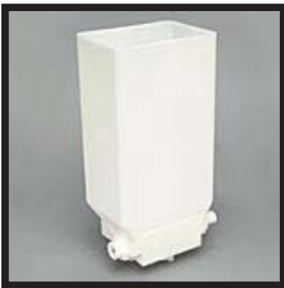
62640 11 LB. Hopper Assy.