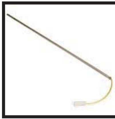
61128 Thermistor Probe