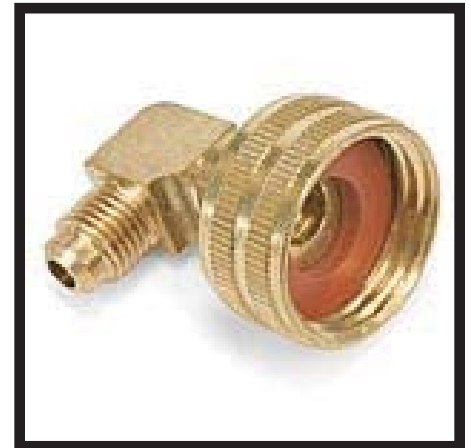
61237 Inlet Adapter