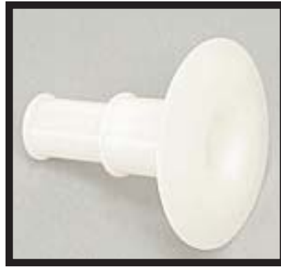
61226 Funnel Quick Disconnect