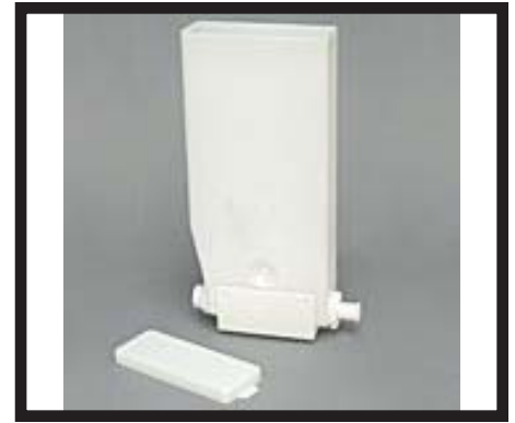
62639 5.5 LB Hopper Assy.