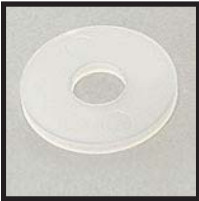
61334 Slinger Washer