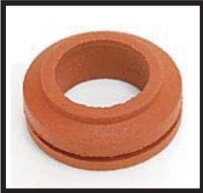
61243 Dump Valve Grommet