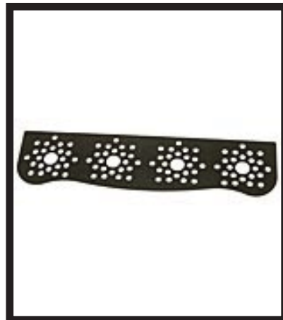
62545 Pic 4 Drip Pan Grid