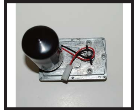
61618 Auger Motor