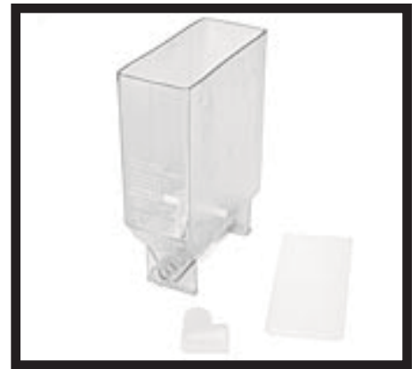
61372 Hopper Assy.