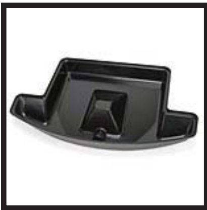
62833 Drip Pan Pic 5