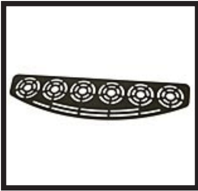
62922 Pic 6 Drip Pan Grid