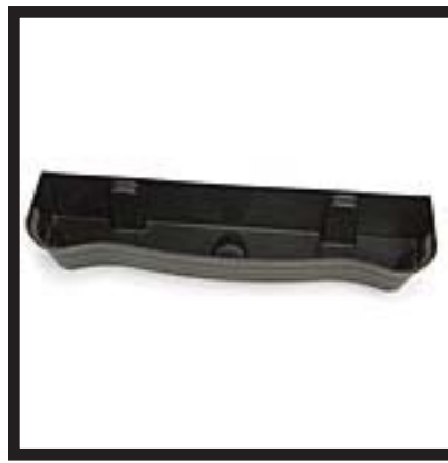
63165 Drip Pan Pic4