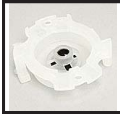
61523 Whipper Base Assy.