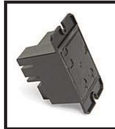
61131 Heater Relay