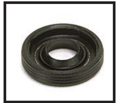
61459 Whipper Base Seal