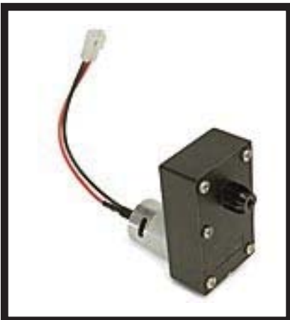
100090 Gearbox (pic 4)