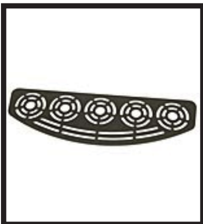
62921 Pic 5 Drip Pan Grid