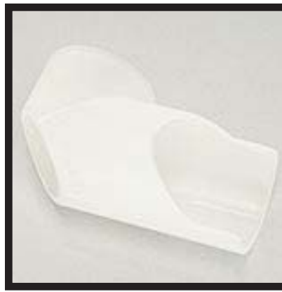
100549 300 degree Elbow