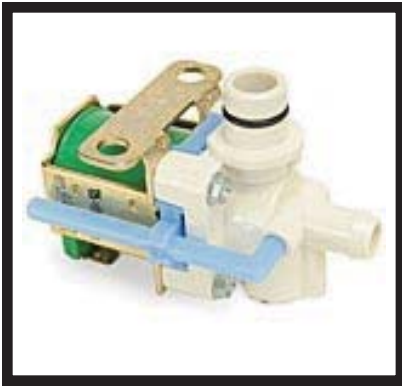
61102 Dump Valve