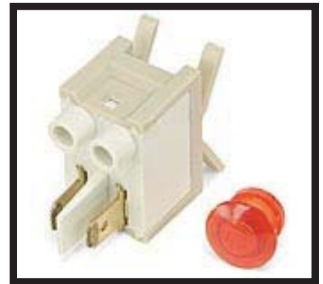
63496 Red Lamp 125 volt