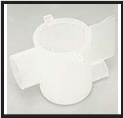
62395 Whipper Camber