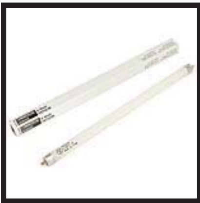
61118 Light Bulb