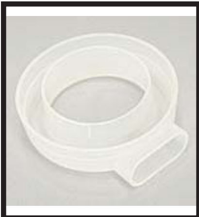
61255 Steam Shroud