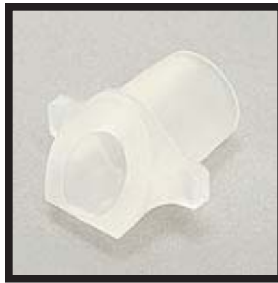
61461 Angled Restrictor Button