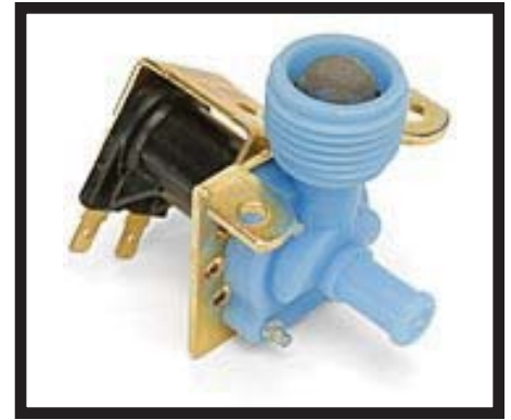
61104 Inlet Valve