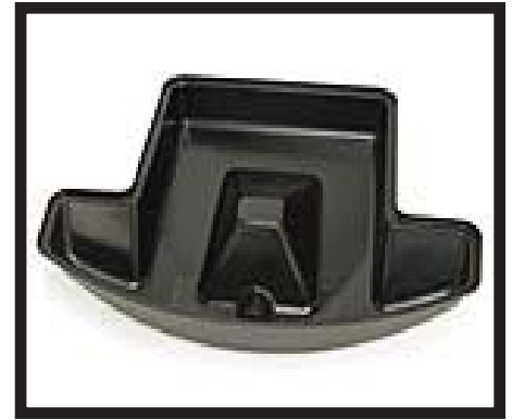
62866 Drip Pan Pic 6