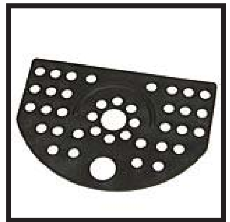
61617 Pic 1 Drip Pan Grid