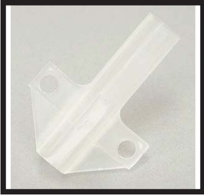
61458 Whipper Blade