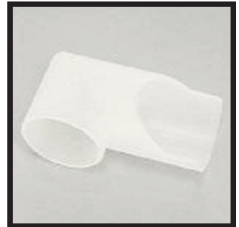
63454 240 Degree Elbow