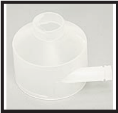
61221 Mixing Funnel