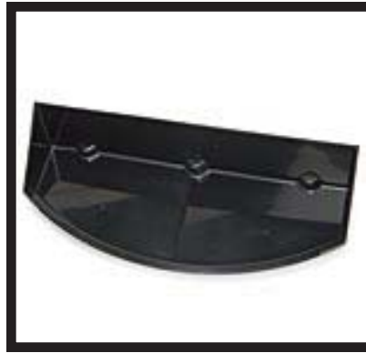
62335 Drip Pan Lowered