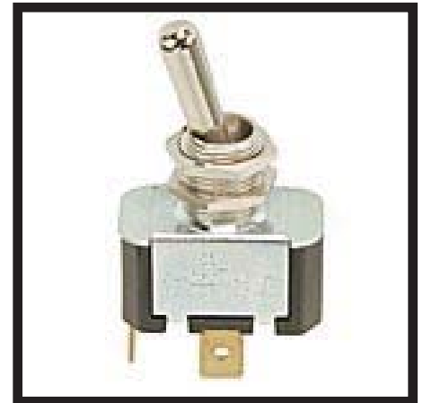
61847 Power Switch