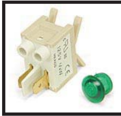
63495 Green Lamp