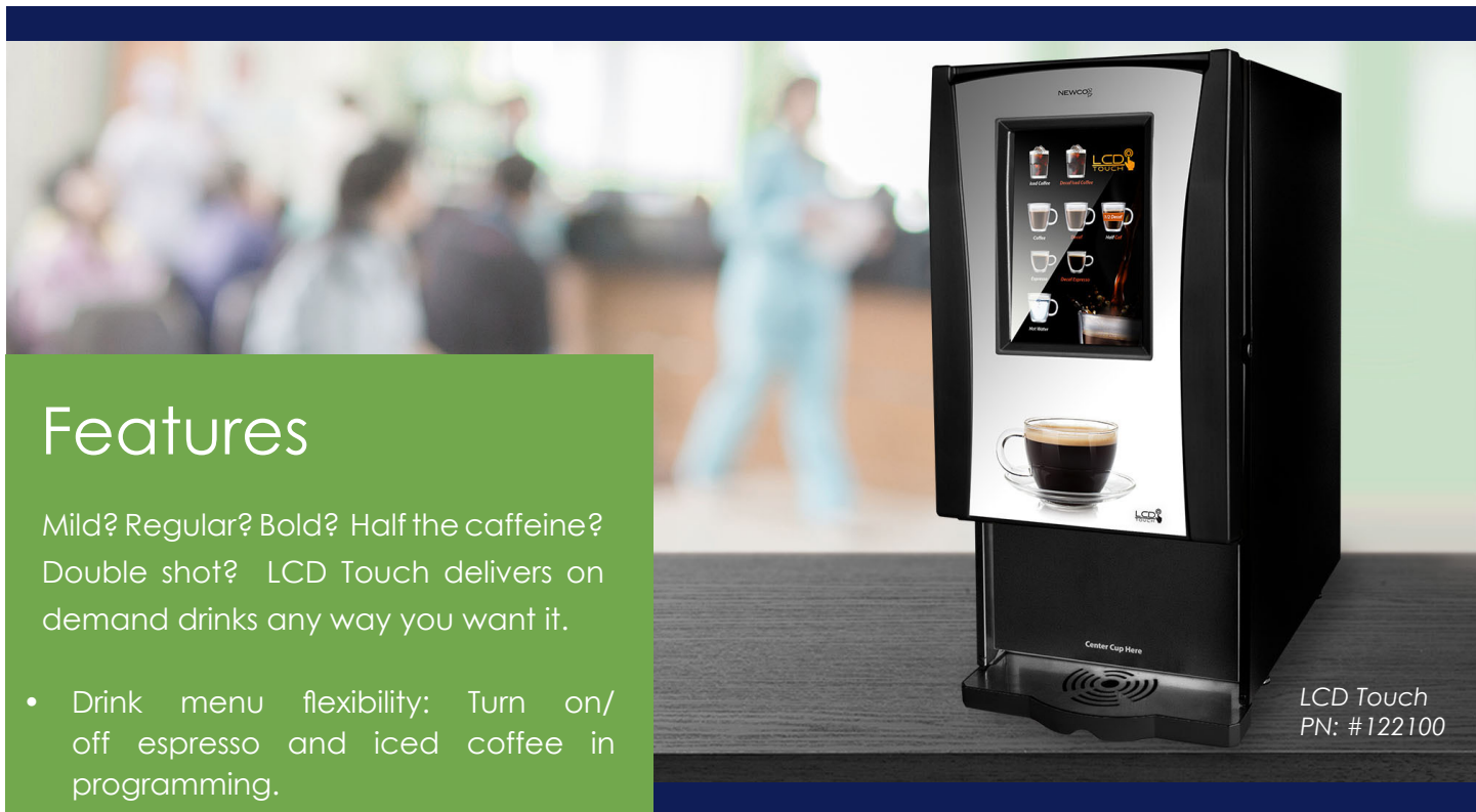
LCD Touch PN: #122100