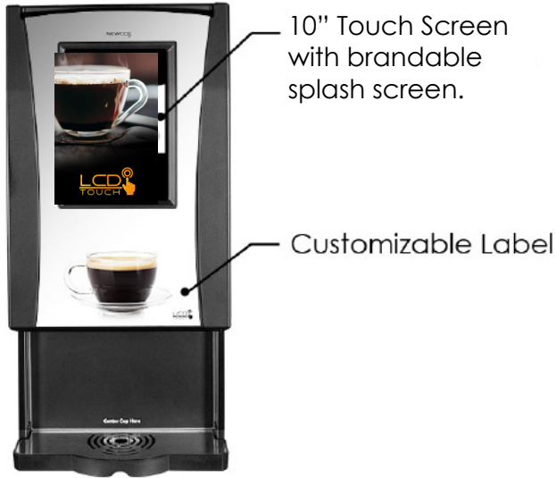
Brandable Splash Screen