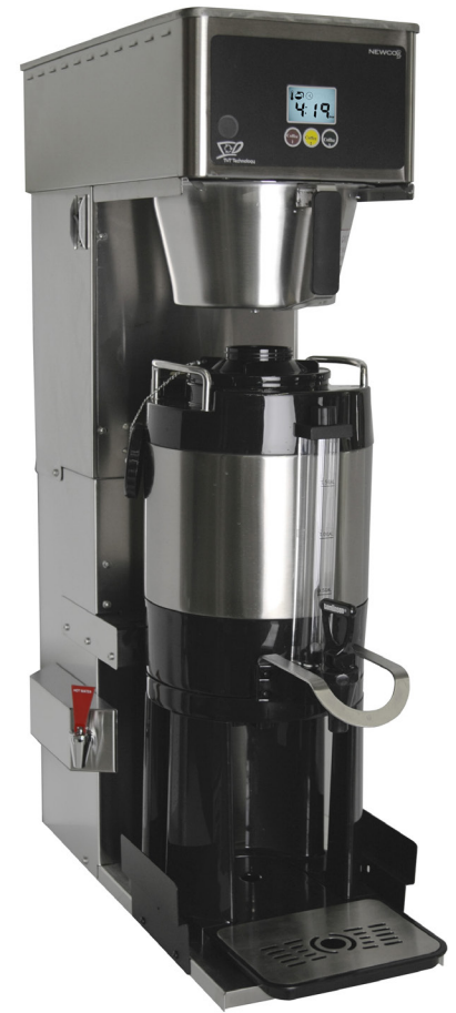
PN: 784840 STVT Combo with Slide Out Shown Above: with a 1.5 Gallon Vaculator Thermal Server with base and drip tray