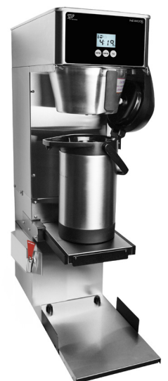
with a 2.5 L Shurizjo Airpot on the slide out.