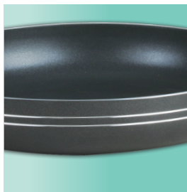
Durable exterior finish.