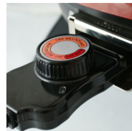
4 heat settings